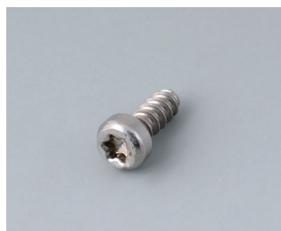
A0325060 Self-tapping screw 2.5 x 6 mm (T8) Stainless steel