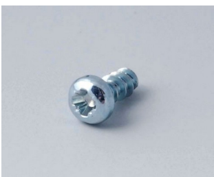
A0305031 Self-tapping screws 2.5 x 6 mm (PZ1)