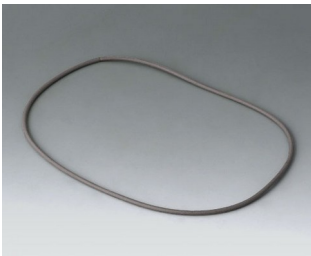
B4514030 Sealing 140