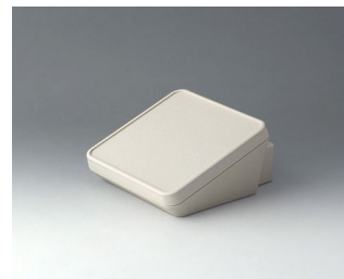
B4414307 PROTEC 140, Vers. III ASA+PC (UL 94 V-0) off-white RAL 9002 140x160x76mm IP 65 opt.