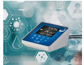
Laboratory measuring device