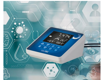
Laboratory measuring device