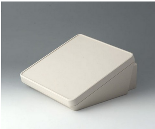
B4422307 PROTEC 220, Vers. III ASA+PC (UL 94 V-0) off-white RAL 9002 220x243x108mm IP 65 opt.