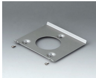
B4518101 Wall suspension element 180 Aluminium