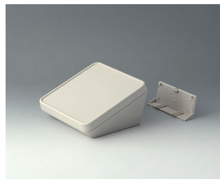
B4414207 PROTEC 140, Vers. II ASA+PC (UL 94 V-0) off-white RAL 9002 140x140x76mm IP 65 opt.