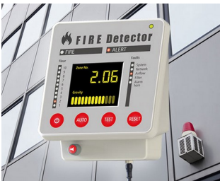
Terminal for fire alarm systems