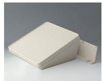
B4422207 PROTEC 220, Vers. II ASA+PC (UL 94 V-0) off-white RAL 9002 220x220x108mm IP 65 opt.