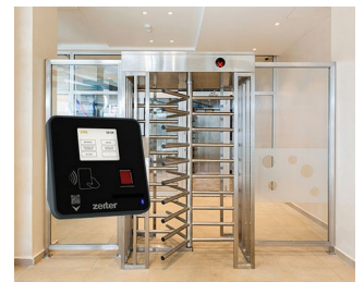
Terminal for access control