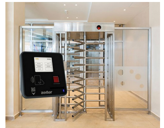
Terminal for access control