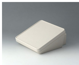
B4418307 PROTEC 180, Vers. III ASA+PC (UL 94 V-0) off-white RAL 9002 180x201x92mm IP 65 opt.