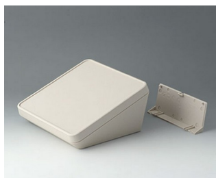
B4418207 PROTEC 180, Vers. II ASA+PC (UL 94 V-0) off-white RAL 9002 180x180x92mm IP 65 opt.