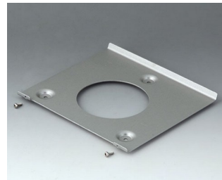
B4522101 Wall suspension element 220 Aluminium