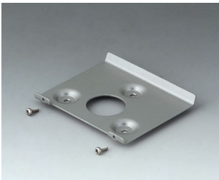
B4514101 Wall suspension element 140 Aluminium