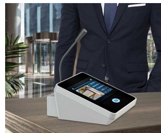
Table microphone / inter phone