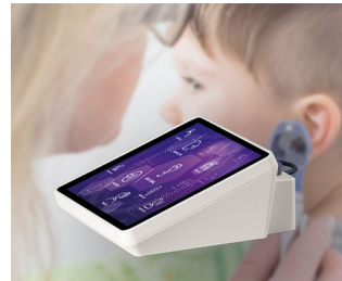
Hearing test device