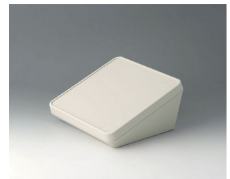
B4418107 PROTEC 180, Vers. I ASA+PC (UL 94 V-0) off-white RAL 9002 180x180x92mm IP 65 opt.