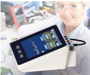
Multimeter measuring device