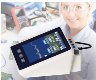
Multimeter measuring device