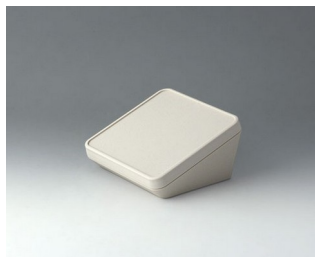
B4414107 PROTEC 140, Vers. I ASA+PC (UL 94 V-0) off-white RAL 9002 140x140x76mm IP 65 opt.