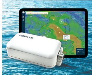
Data Collection for Ocean Observation network