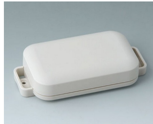
C3206107 EASYTEC 100 ASA+PC (UL 94 V-0) off-white RAL 9002 121x62x26mm IP 65 opt., IP 40