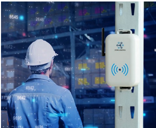
Smart store logistics