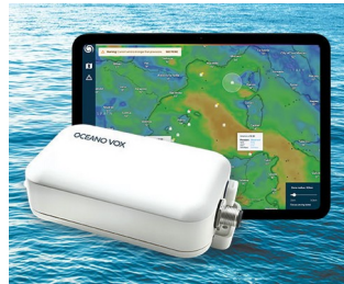
Data Collection for Ocean Observation network