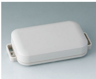
C3207107 EASYTEC 125 ASA+PC (UL 94 V-0) off-white RAL 9002 147x78x30mm IP 65 opt., IP 40