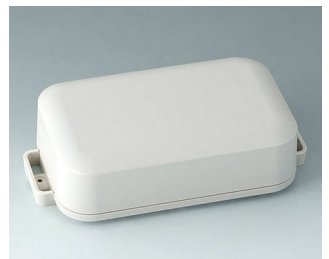
C3208207 EASYTEC 150 ASA+PC (UL 94 V-0) off-white RAL 9002 172x93x46mm IP 65 opt., IP 40