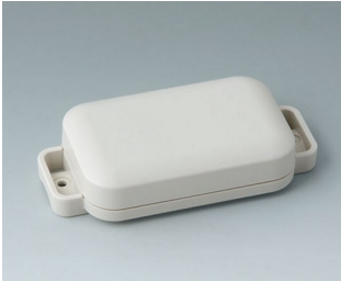
C3204107 EASYTEC 80 ASA+PC (UL 94 V-0) off-white RAL 9002 101x50x22mm IP 65 opt., IP 40