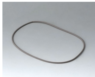
A9503030 Sealing 125