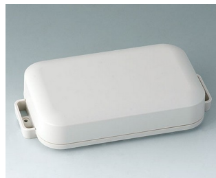
C3208107 EASYTEC 150 ASA+PC (UL 94 V-0) off-white RAL 9002 172x93x36mm IP 65 opt., IP 40