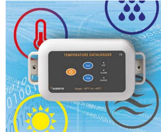
Data logger e.g. for temperature