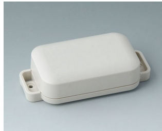
C3204207 EASYTEC 80 ASA+PC (UL 94 V-0) off-white RAL 9002 101x50x26mm IP 65 opt., IP 40