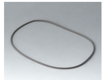
A9504030 Sealing 150