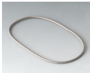
A9502030 Sealing 100