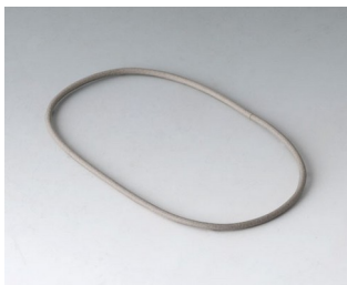
A9500030 Sealing 80