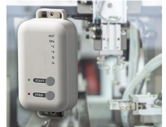
Data logger with gateway function