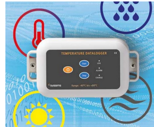
Data logger e.g. for temperature