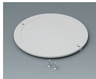
B5011847 Lid ABS (UL 94 HB) off-white RAL 9002