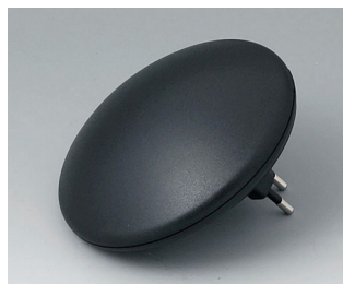
B5011329 ART-CASE R110 H PC+ABS (UL 94 V-0) black RAL 9005 ø110x41mm IP 40