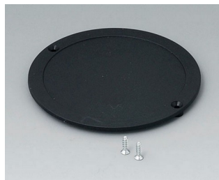
B5011859 Battery compartment lid ABS (UL 94 HB) black RAL 9005