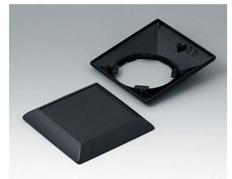
B5012209 Bottom and top part S110 F ABS (UL 94 HB) black RAL 9005 110x110x38mm