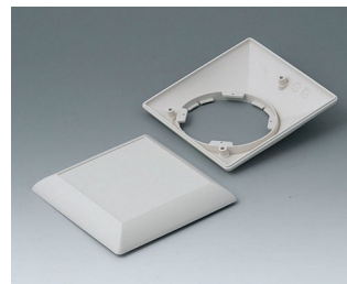
B5012207 Bottom and top part S110 F ABS (UL 94 HB) off-white RAL 9002 110x110x38mm