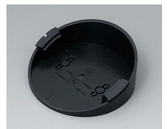
B5011219 Base 30° ABS (UL 94 HB) black RAL 9005