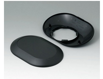
B5015209 Bottom and top part O160 F ABS (UL 94 HB) black RAL 9005 160x110x38mm