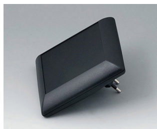
B5013229 ART-CASE S110 F PC+ABS (UL 94 V-0) black RAL 9005 110x110x38mm IP 40