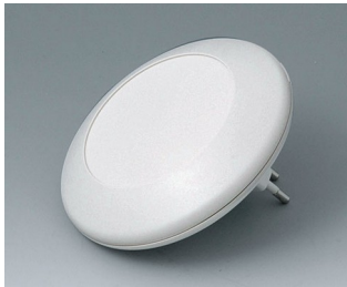
B5011227 ART-CASE R110 F PC+ABS (UL 94 V-0) off-white RAL 9002 ø110x38mm IP 40