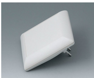
B5013227 ART-CASE S110 F PC+ABS (UL 94 V-0) off-white RAL 9002 110x110x38mm IP 40