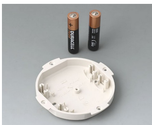
B5111107 Battery compartment, 2 x AAA ABS (UL 94 HB) off-white RAL 9002