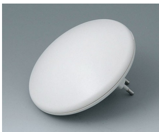
B5011327 ART-CASE R110 H PC+ABS (UL 94 V-0) off-white RAL 9002 ø110x41mm IP 40