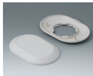
B5015007 Bottom and top part O160 F ABS (UL 94 HB) off-white RAL 9002 160x110x30mm