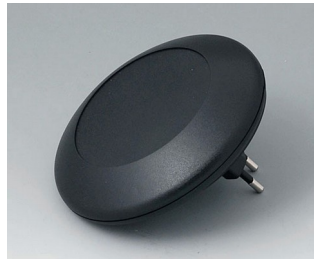
B5011229 ART-CASE R110 F PC+ABS (UL 94 V-0) black RAL 9005 ø110x38mm IP 40