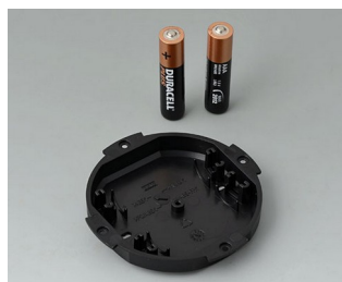
B5111109 Battery compartment, 2 x AAA ABS (UL 94 HB) black RAL 9005