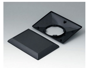
B5017209 Bottom and top part E160 F ABS (UL 94 HB) black RAL 9005 160x110x38mm