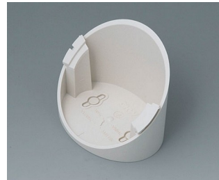
B5011317 Base 55° ABS (UL 94 HB) off-white RAL 9002