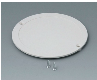
B5011857 Battery compartment lid ABS (UL 94 HB) off-white RAL 9002