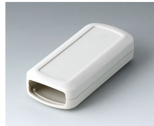
B2823107 CONNECT S ASA+PC (UL 94 V-0) off-white RAL 9002 90x42x22mm