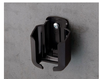
B2921509 Holder S ASA+PC (UL 94 V-0) black RAL 9005