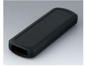
B2834109 CONNECT M ASA+PC (UL 94 V-0) black RAL 9005 156x54x22mm