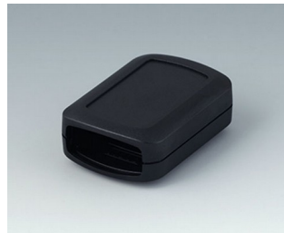
B2822109 CONNECT S ASA+PC (UL 94 V-0) black RAL 9005 60x42x22mm