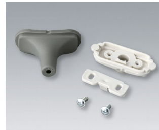
B2911308 Cable gland kit, 3.4 - 4.2 TPE volcano