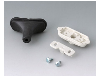
B2911309 Cable gland kit, 3.4 - 4.2 TPE black RAL 9005