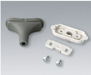
B2911318 Cable gland kit, 4.2 - 5.0 TPE volcano