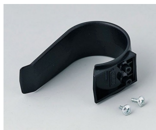
A9167029 Holding clamp PA 6 (UL 94 HB) black RAL 9005