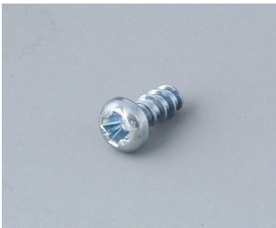
A0304031 Self-tapping screws 2.2 x 5 mm (PZ1)

Subject to technical modification without notice. © by OKW Gehäusesysteme, Buchen/Germany.