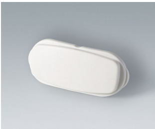
B2811207 End part ASA+PC (UL 94 V-0) off-white RAL 9002