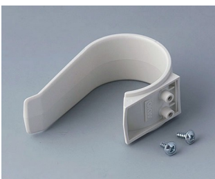
A9167027 Holding clamp PA 6 (UL 94 HB) off-white RAL 9002