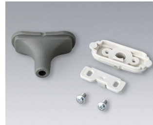
B2911328 Cable gland kit, 5.0 - 5.9 TPE volcano