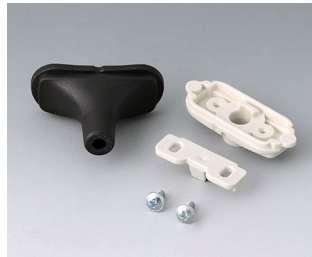
B2911319 Cable gland kit, 4.2 - 5.0 TPE black RAL 9005