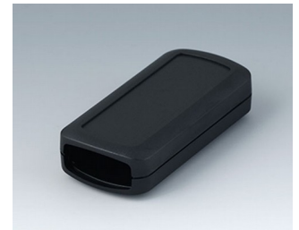
B2823109 CONNECT S ASA+PC (UL 94 V-0) black RAL 9005 90x42x22mm