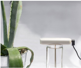
Tool for making colloidal silver solutions