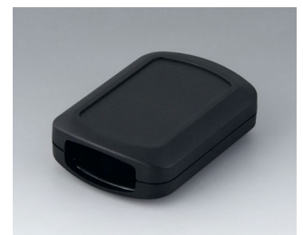
B2832109 CONNECT M ASA+PC (UL 94 V-0) black RAL 9005 76x54x22mm