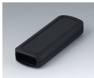
B2824109 CONNECT S ASA+PC (UL 94 V-0) black RAL 9005 120x42x22mm