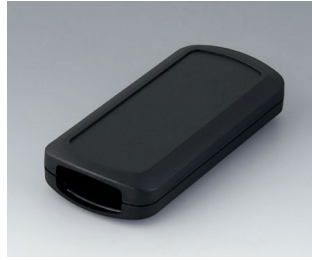
B2833109 CONNECT M ASA+PC (UL 94 V-0) black RAL 9005 116x54x22mm