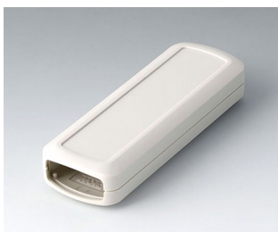
B2824107 CONNECT S ASA+PC (UL 94 V-0) off-white RAL 9002 120x42x22mm