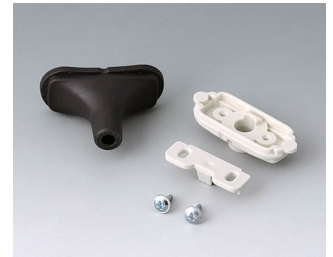
B2911329 Cable gland kit, 5.0 - 5.9 TPE black RAL 9005