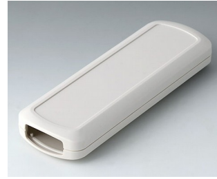
B2834107 CONNECT M ASA+PC (UL 94 V-0) off-white RAL 9002 156x54x22mm