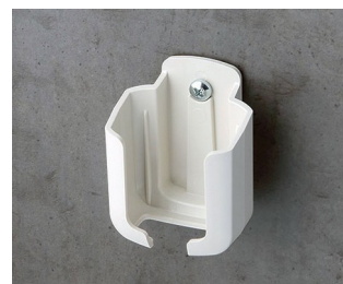
B2921507 Holder S ASA+PC (UL 94 V-0) off-white RAL 9002