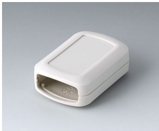
B2822107 CONNECT S ASA+PC (UL 94 V-0) off-white RAL 9002 60x42x22mm