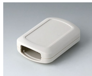
B2832107 CONNECT M ASA+PC (UL 94 V-0) off-white RAL 9002 76x54x22mm