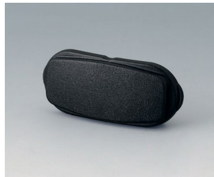
B2811209 End part ASA+PC (UL 94 V-0) black RAL 9005