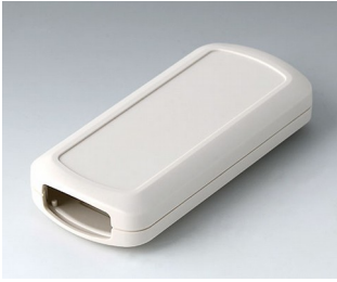
B2833107 CONNECT M ASA+PC (UL 94 V-0) off-white RAL 9002 116x54x22mm