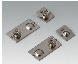
A9190024 Set of battery clips, 3 x AAA Steel nickel-plated