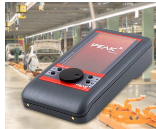
Mobile diagnostic device for CAN and CAN FD buses