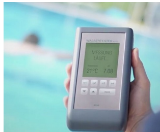
Electronic pool tester