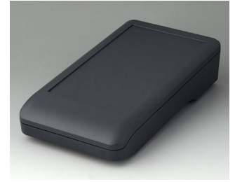
A9007118 DATEC-COMPACT L ASA+PC (UL 94 V-0) lava 206x110x47mm IP 41