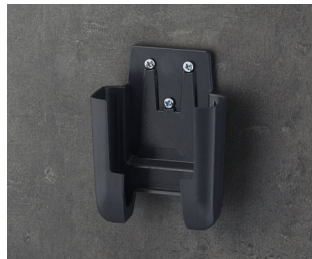
A9105628 Holder S ASA+PC (UL 94 V-0) lava