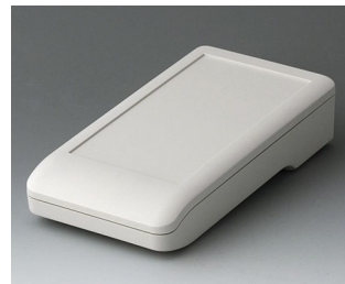
A9006117 DATEC-COMPACT M ASA+PC (UL 94 V-0) off-white RAL 9002 172x92x39mm IP 41