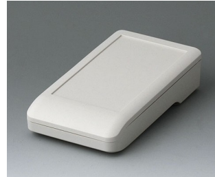
A9005117 DATEC-COMPACT S ASA+PC (UL 94 V-0) off-white RAL 9002 136x74x32mm IP 41