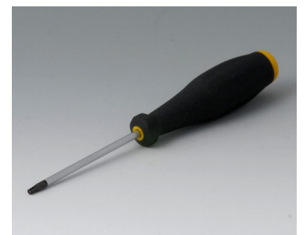
A0399T10 Torx T10 screwdriver