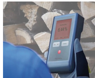
Wood moisture measuring device