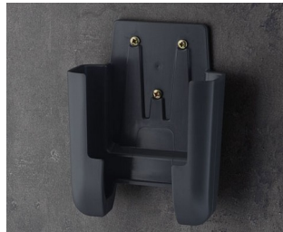
A9107628 Holder L ASA+PC (UL 94 V-0) lava