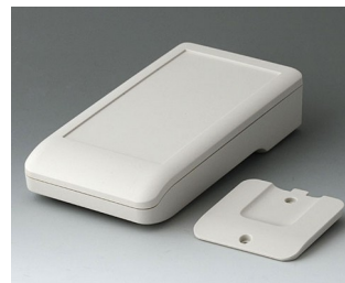
A9006217 DATEC-COMPACT M ASA+PC (UL 94 V-0) off-white RAL 9002 172x92x39mm IP 41