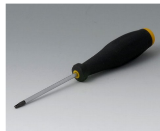
A0399T08 Torx T8 screwdriver