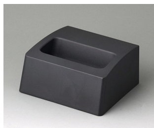
A9105508 Station S ASA+PC (UL 94 V-0) lava