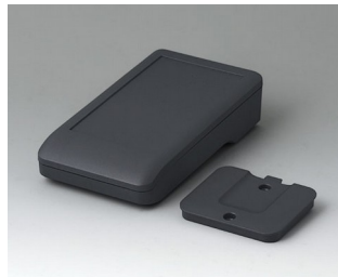
A9005208 DATEC-COMPACT S ASA+PC (UL 94 V-0) lava 136x74x32mm IP 65