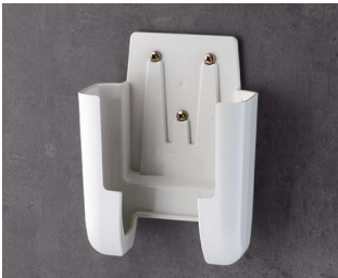
A9107627 Holder L ASA+PC (UL 94 V-0) off-white RAL 9002