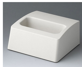
A9106507 Station M ASA+PC (UL 94 V-0) off-white RAL 9002