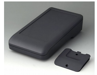
A9007218 DATEC-COMPACT L ASA+PC (UL 94 V-0) lava 206x110x47mm IP 41