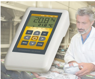
Atmospheric oxygen measuring unit