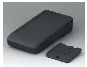
A9006218 DATEC-COMPACT M ASA+PC (UL 94 V-0) lava 172x92x39mm IP 41