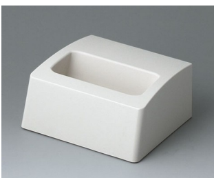
A9105507 Station S ASA+PC (UL 94 V-0) off-white RAL 9002