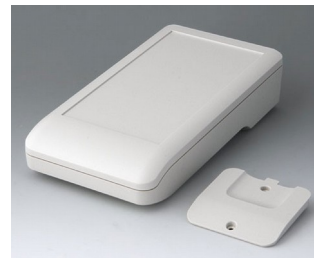
A9007217 DATEC-COMPACT L ASA+PC (UL 94 V-0) off-white RAL 9002 206x110x47mm IP 41