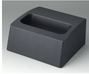
A9107508 Station L ASA+PC (UL 94 V-0) lava