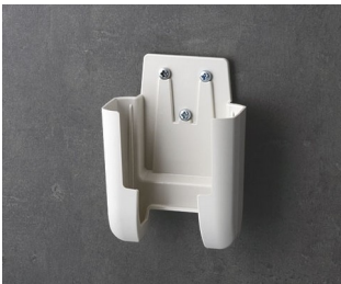
A9105627 Holder S ASA+PC (UL 94 V-0) off-white RAL 9002