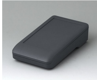
A9005108 DATEC-COMPACT S ASA+PC (UL 94 V-0) lava 136x74x32mm IP 65