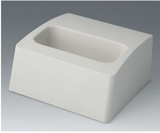
A9107507 Station L ASA+PC (UL 94 V-0) off-white RAL 9002