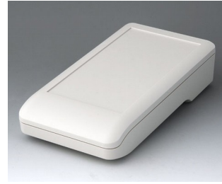
A9007117 DATEC-COMPACT L ASA+PC (UL 94 V-0) off-white RAL 9002 206x110x47mm IP 41