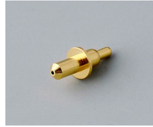
A9193031 Spring contact gold-plated