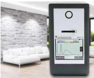
Spectral light meter