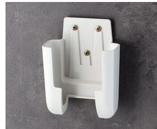
A9106627 Holder M ASA+PC (UL 94 V-0) off-white RAL 9002