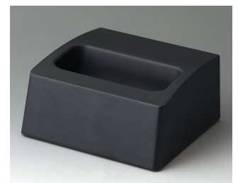
A9106508 Station M ASA+PC (UL 94 V-0) lava