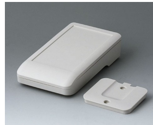
A9005217 DATEC-COMPACT S ASA+PC (UL 94 V-0) off-white RAL 9002 136x74x32mm IP 41