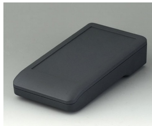
A9006108 DATEC-COMPACT M ASA+PC (UL 94 V-0) lava 172x92x39mm IP 65