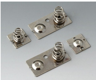
A9190023 Set of battery clips, 3 x AA Steel nickel-plated