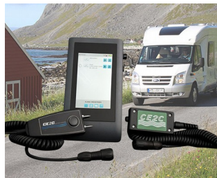
System for leak detection in leisure vehicles