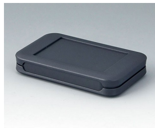
A9050108 SOFT-CASE S ABS (UL 94 HB) lava 51x82x14mm IP 54 opt., IP 40