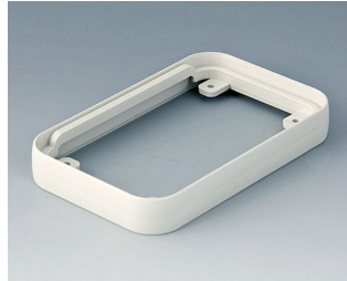
A9150017 Intermediate ring S ABS (UL 94 HB) off-white RAL 9002 54x85x12mm