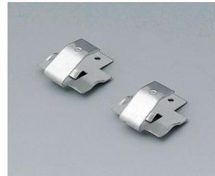
A9174006 Set of battery clips, 1 x 9 V Steel tin-plated