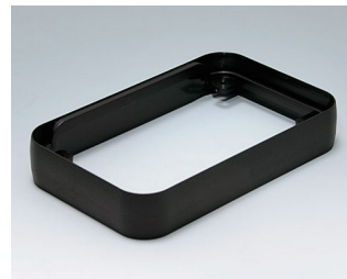
A9152219 Intermediate ring L PMMA (IR) (UL 94 HB) black RAL 9005 76x120x21mm