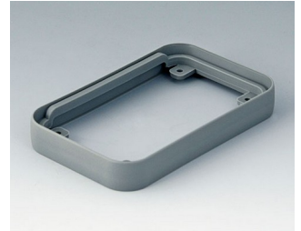
A9150118 Intermediate protection ring S SEBS (TPE) volcano 54x85x12mm