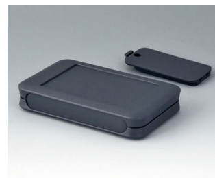
A9051118 SOFT-CASE M ABS (UL 94 HB) lava 65x105x19mm IP 40