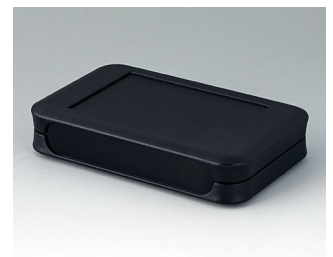
A9052209 SOFT-CASE L PMMA (IR) (UL 94 HB) black RAL 9005 73x117x24mm IP 54 opt., IP 40