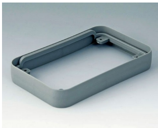
A9151118 Intermediate protection ring M SEBS (TPE) volcano 68x108x16mm