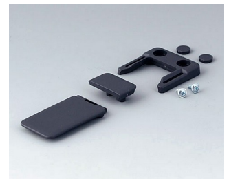
A9152048 Combi-Clip ABS (UL 94 HB) lava 45x27mm