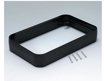
A9153219 Intermediate ring XL PMMA (IR) (UL 94 HB) black RAL 9005 96x154x26mm