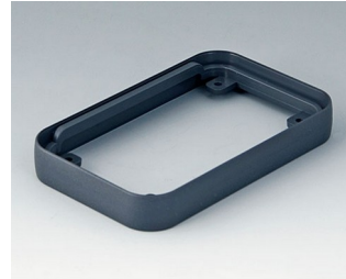
A9150018 Intermediate ring S ABS (UL 94 HB) lava 54x85x12mm