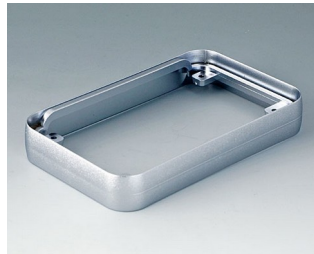
A9151011 Intermediate ring M ABS (UL 94 HB) matt chromed 68x108x16mm