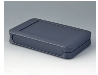
A9053108 SOFT-CASE XL ABS (UL 94 HB) lava 92x150x28mm IP 40