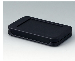
A9050209 SOFT-CASE S PMMA (IR) (UL 94 HB) black RAL 9005 51x82x14mm IP 54 opt., IP 40