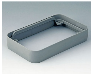
A9152118 Intermediate protection ring L SEBS (TPE) volcano 76x120x21mm