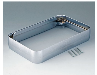
A9153011 Intermediate ring XL ABS (UL 94 HB) matt chromed 96x154x26mm