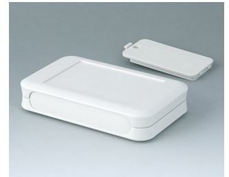
A9052117 SOFT-CASE L ABS (UL 94 HB) off-white RAL 9002 73x117x24mm IP 40