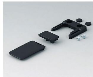
A9152049 Combi-Clip ABS (UL 94 HB) black RAL 9005 45x27mm