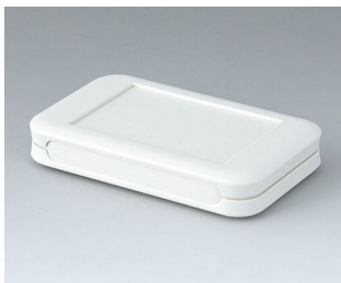
A9050107 SOFT-CASE S ABS (UL 94 HB) off-white RAL 9002 51x82x14mm IP 54 opt., IP 40