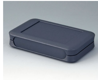
A9052108 SOFT-CASE L ABS (UL 94 HB) lava 73x117x24mm IP 54 opt., IP 40