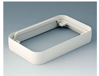
A9152017 Intermediate ring L ABS (UL 94 HB) off-white RAL 9002 76x120x21mm