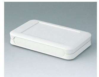
A9051107 SOFT-CASE M ABS (UL 94 HB) off-white RAL 9002 65x105x19mm IP 54 opt., IP 40