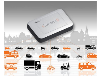
Module for smart mobility applications