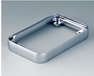
A9150011 Intermediate ring S ABS (UL 94 HB) matt chromed 54x85x12mm