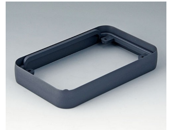
A9151018 Intermediate ring M ABS (UL 94 HB) lava 68x108x16mm