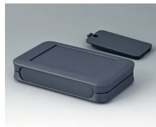
A9052128 SOFT-CASE L ABS (UL 94 HB) lava 73x117x24mm IP 40