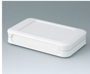
A9052107 SOFT-CASE L ABS (UL 94 HB) off-white RAL 9002 73x117x24mm IP 54 opt., IP 40