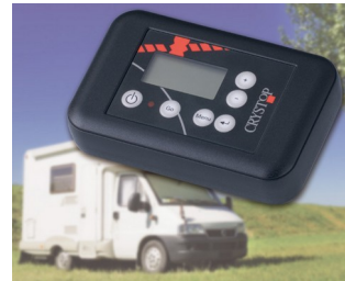
Remote control unit for AutoSat satellite receiver