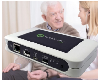
Real-time localisation in the healthcare sector