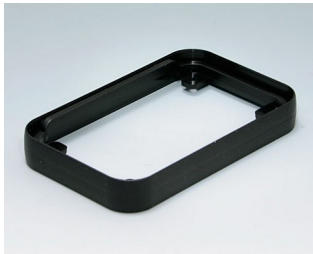
A9150219 Intermediate ring S PMMA (IR) (UL 94 HB) black RAL 9005 54x85x12mm