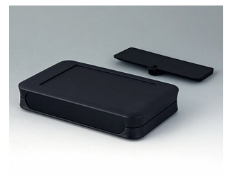
A9053219 SOFT-CASE XL PMMA (IR) (UL 94 HB) black RAL 9005 92x150x28mm IP 40