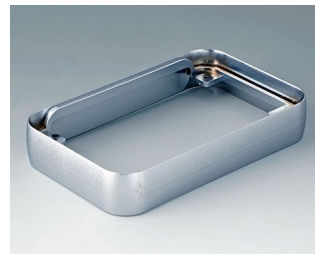
A9152011 Intermediate ring L ABS (UL 94 HB) matt chromed 76x120x21mm