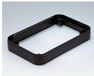
A9152129 Intermediate ring M PMMA (IR) (UL 94 HB) black RAL 9005 68x108x16mm