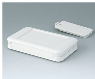
A9051117 SOFT-CASE M ABS (UL 94 HB) off-white RAL 9002 65x105x19mm IP 40