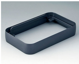
A9152018 Intermediate ring L ABS (UL 94 HB) lava 76x120x21mm