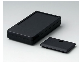
A9071219 DATEC-POCKET-BOX M PMMA (IR) (UL 94 HB) black RAL 9005 105x58x18.5mm IP 54