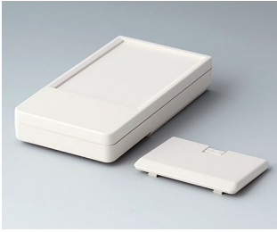
A9072127 DATEC-POCKET-BOX L ABS (UL 94 HB) off-white RAL 9002 120x65x22mm IP 41