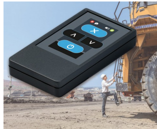
Radio transmitter for machines