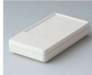
A9070117 DATEC-POCKET-BOX S ABS (UL 94 HB) off-white RAL 9002 85x46x16mm IP 54