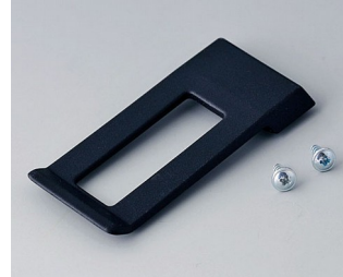
A9172109 Belt/Pocket clip ABS (UL 94 HB) black RAL 9005 62x30mm