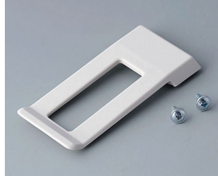
A9172107 Belt/Pocket clip ABS (UL 94 HB) off-white RAL 9002 62x30mm