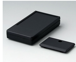
A9071209 DATEC-POCKET-BOX M PMMA (IR) (UL 94 HB) black RAL 9005 105x58x18.5mm IP 41