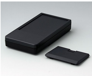
A9072229 DATEC-POCKET-BOX L PMMA (IR) (UL 94 HB) black RAL 9005 120x65x22mm IP 41