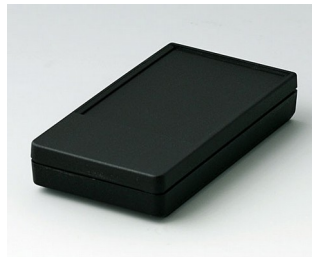
A9070219 DATEC-POCKET-BOX S PMMA (IR) (UL 94 HB) black RAL 9005 85x46x16mm IP 54