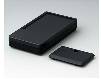
A9072219 DATEC-POCKET-BOX L PMMA (IR) (UL 94 HB) black RAL 9005 120x65x22mm IP 54