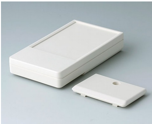
A9071117 DATEC-POCKET-BOX M ABS (UL 94 HB) off-white RAL 9002 105x58x18.5mm IP 54