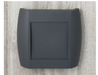
A9093108 DIATEC S