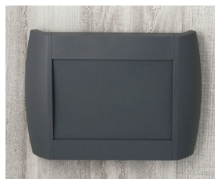
A9094108 DIATEC M