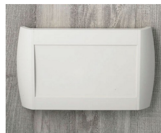
A9095107 DIATEC L