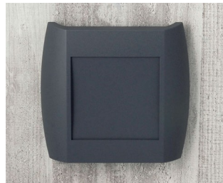
A9092108 DIATEC XS