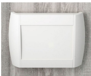
A9094107 DIATEC M