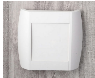
A9093107 DIATEC S