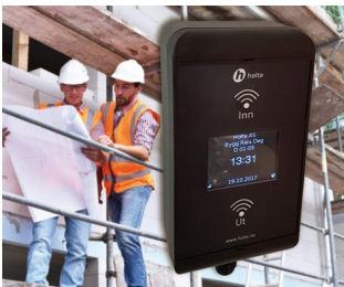
RFID card reader for construction site workers