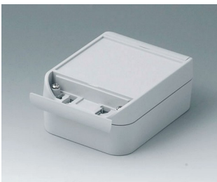
C6009121 SMART-BOX WIDTH 90 ASA+PC (UL 94 V-0) light grey RAL 7035 120x90x50mm IP 66