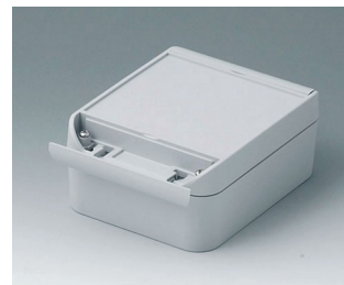
C6011141 SMART-BOX WIDTH 110 ASA+PC (UL 94 V-0) light grey RAL 7035 140x110x60mm IP 66