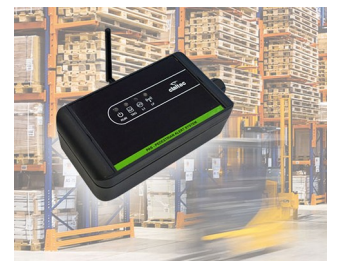
Pedestrian Alert System