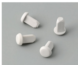
C2299018 Case feet TPE (UL 94 HB)