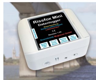
Miniature data logger for crack displacements and climatic data