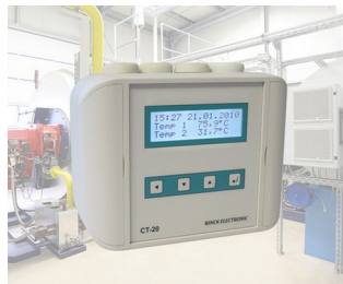
Universal temperature controller / Temperature difference controller