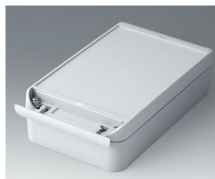
C6013221 SMART-BOX WIDTH 130 ASA+PC (UL 94 V-0) light grey RAL 7035 220x130x60mm IP 66