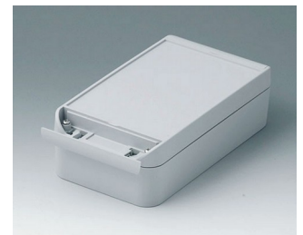
C6011201 SMART-BOX WIDTH 110 ASA+PC (UL 94 V-0) light grey RAL 7035 200x110x60mm IP 66