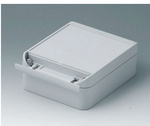
C6013161 SMART-BOX WIDTH 130 ASA+PC (UL 94 V-0) light grey RAL 7035 160x130x60mm IP 66