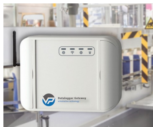
Data logger for machine monitoring