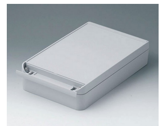
C6017281 SMART-BOX WIDTH 170 ASA+PC (UL 94 V-0) light grey RAL 7035 280x170x60mm IP 65