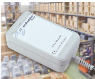
Active UHF RFID system