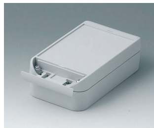
C6009161 SMART-BOX WIDTH 90 ASA+PC (UL 94 V-0) light grey RAL 7035 160x90x50mm IP 66