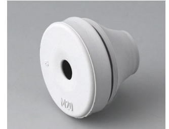
C2320137 Cable grommet EPDM light grey RAL 7035 IP 67