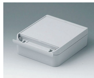
C6015181 SMART-BOX WIDTH 150 ASA+PC (UL 94 V-0) light grey RAL 7035 180x150x60mm IP 66