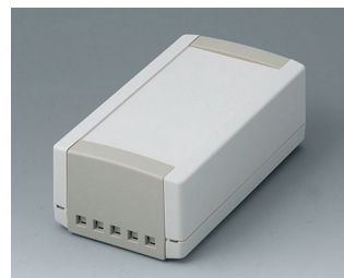
B1060465 TOPTEC 154 H, Vers. II ABS (UL 94 HB) off-white RAL 9002 154x84x56mm IP 40