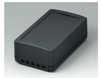
B1070469 TOPTEC 194 H, Vers. II ABS (UL 94 HB) black RAL 9005 194x115x68mm IP 40