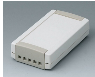
B1055465 TOPTEC 123 F, Vers. II ABS (UL 94 HB) off-white RAL 9002 123x68x30mm IP 40