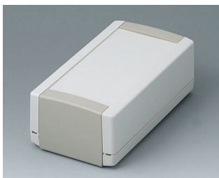
B1060365 TOPTEC 154 H, Vers. I ABS (UL 94 HB) off-white RAL 9002 154x84x56mm IP 40