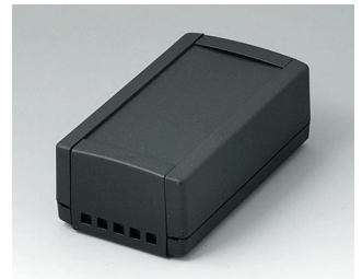
B1050469 TOPTEC 123 H, Vers. II ABS (UL 94 HB) black RAL 9005 123x68x45mm IP 40