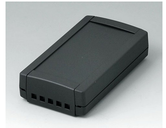
B1055469 TOPTEC 123 F, Vers. II ABS (UL 94 HB) black RAL 9005 123x68x30mm IP 40