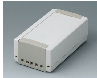
B1050465 TOPTEC 123 H, Vers. II ABS (UL 94 HB) off-white RAL 9002 123x68x45mm IP 40