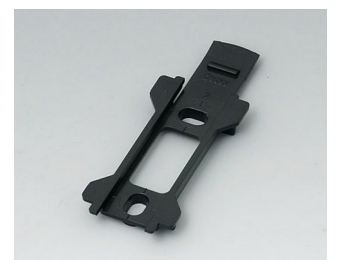
B1340029 Wall suspension element for Topotec 102 ABS (UL 94 HB) black RAL 9005