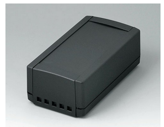
B1060469 TOPTEC 154 H, Vers. II ABS (UL 94 HB) black RAL 9005 154x84x56mm IP 40