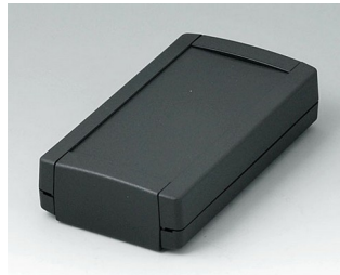
B1055369 TOPTEC 123 F, Vers. I ABS (UL 94 HB) black RAL 9005 123x68x30mm IP 40