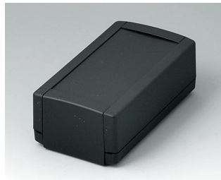
B1050369 TOPTEC 123 H, Vers. I ABS (UL 94 HB) black RAL 9005 123x68x45mm IP 40