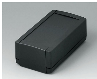
B1060369 TOPTEC 154 H, Vers. I ABS (UL 94 HB) black RAL 9005 154x84x56mm IP 40