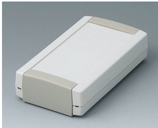
B1055365 TOPTEC 123 F, Vers. I ABS (UL 94 HB) off-white RAL 9002 123x68x30mm IP 40