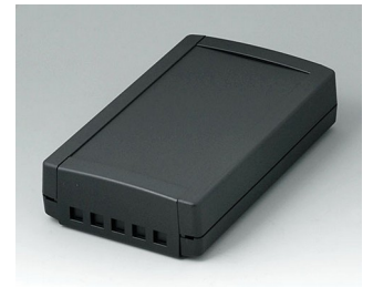
B1075469 TOPTEC 194 F, Vers. II ABS (UL 94 HB) black RAL 9005 194x115x46mm IP 40