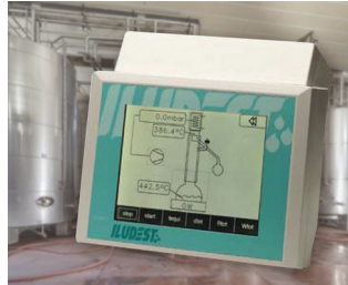
Device for monitoring and controlling distillation units