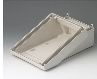
B4016117 DATEC-TERMINAL M, Vers. I ABS (UL 94 HB) off-white RAL 9002 168x272x101mm IP 54 opt.