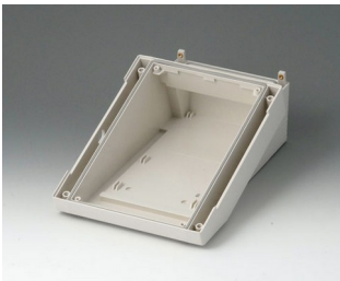
B4016317 DATEC-TERMINAL M, Vers. III ABS (UL 94 HB) off-white RAL 9002 168x272x101mm IP 54 opt.