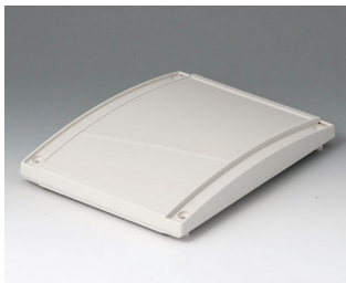
B4016637 Cover M, convex ABS (UL 94 HB) off-white RAL 9002 168x220x29mm