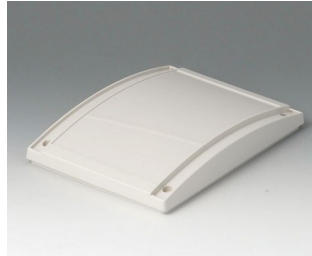
B4013637 Cover S, convex ABS (UL 94 HB) off-white RAL 9002 130x180x28mm