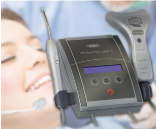
Dental Whitening and laser therapy

Systems for data collection on the job and machines, access and security controls, measuring and controlling, heating and air-conditioning units, medical, wellness, point-of-sale devices, etc.