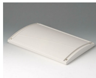
B4026637 Cover SL, convex ABS (UL 94 HB) off-white RAL 9002 263x180x28mm