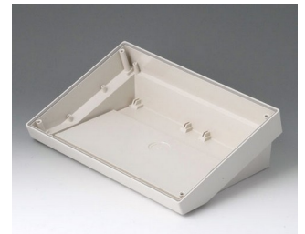
B4026117 DATEC-TERMINAL SL ABS (UL 94 HB) off-white RAL 9002 264x180x86mm IP 54 opt.