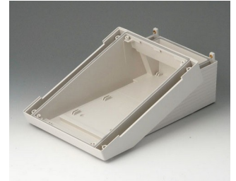
B4016217 DATEC-TERMINAL M, Vers. II ABS (UL 94 HB) off-white RAL 9002 168x272x101mm IP 54 opt.