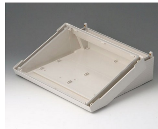
B4030217 DATEC-TERMINAL L, Vers. II ABS (UL 94 HB) off-white RAL 9002 302x272x101mm IP 54 opt.