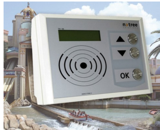
Versatile terminal for leisure facilities