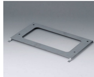
B4126147 Wall suspension element SL Steel galvanized 210x137x8mm