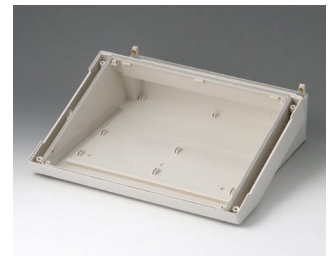
B4030317 DATEC-TERMINAL L, Vers. III ABS (UL 94 HB) off-white RAL 9002 302x272x101mm IP 54 opt.