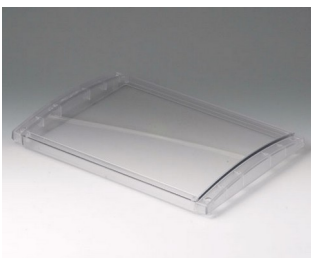
B4030631 Cover L, convex PC (UL 94 V-0) transparent 302x220x29mm