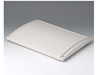
B4030637 Cover L, convex ABS (UL 94 HB) off-white RAL 9002 302x220x29mm