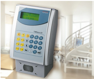
Terminal for time recording, access control and order management