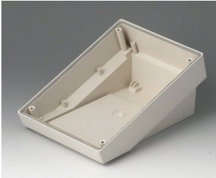
B4013117 DATEC-TERMINAL S ABS (UL 94 HB) off-white RAL 9002 130x180x86mm IP 54 opt.