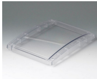
B4016631 Cover M, convex PC (UL 94 V-0) transparent 168x220x29mm