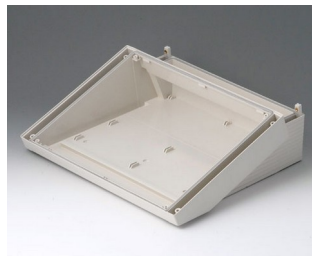
B4030117 DATEC-TERMINAL L, Vers. I ABS (UL 94 HB) off-white RAL 9002 302x272x101mm IP 54 opt.