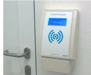
RFID access control readers