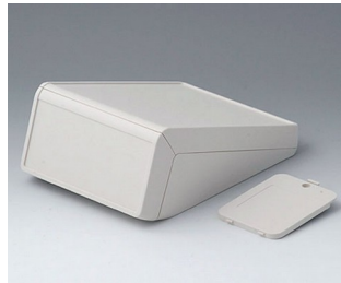
B4056217 UNITEC M, 1.4/1.4 ABS (UL 94 HB) off-white RAL 9002 148x210x80mm IP 40