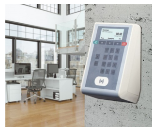
Time recording terminal