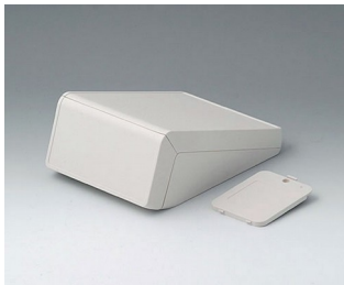
B4054207 UNITEC S, 0.6/0.6 ABS (UL 94 HB) off-white RAL 9002 125x177x69mm IP 40