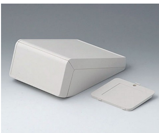
B4056307 UNITEC M, 0.6/0.6 ABS (UL 94 HB) off-white RAL 9002 148x210x80mm IP 40