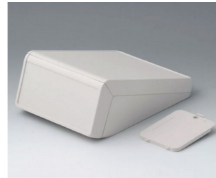
B4056227 UNITEC M, 1.4/0.6 ABS (UL 94 HB) off-white RAL 9002 148x210x80mm IP 40