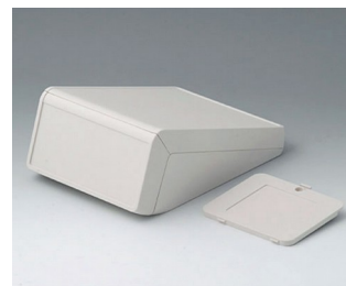
B4056327 UNITEC M, 1.4/0.6 ABS (UL 94 HB) off-white RAL 9002 148x210x80mm IP 40