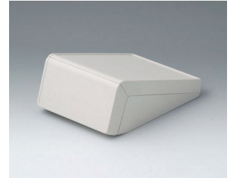
B4054137 UNITEC S, 0.6/1.4 ABS (UL 94 HB) off-white RAL 9002 125x177x69mm IP 40