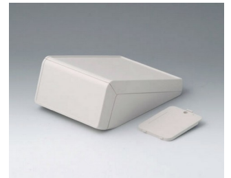
B4054237 UNITEC S, 0.6/1.4 ABS (UL 94 HB) off-white RAL 9002 125x177x69mm IP 40