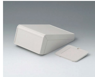
B4054327 UNITEC S, 1.4/0.6 ABS (UL 94 HB) off-white RAL 9002 125x177x69mm IP 40