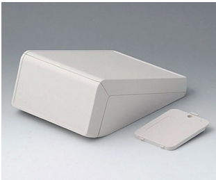
B4056207 UNITEC M, 0.6/0.6 ABS (UL 94 HB) off-white RAL 9002 148x210x80mm IP 40