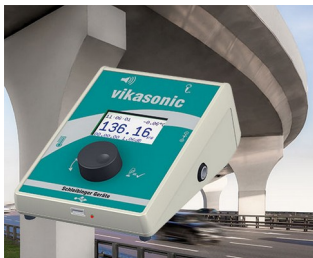
Ultrasonic measuring device