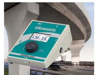
Ultrasonic measuring device