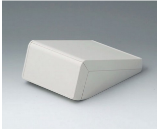
B4054107 UNITEC S, 0.6/0.6 ABS (UL 94 HB) off-white RAL 9002 125x177x69mm IP 40