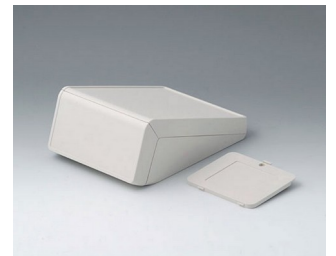
B4054337 UNITEC S, 0.6/1.4 ABS (UL 94 HB) off-white RAL 9002 125x177x69mm IP 40