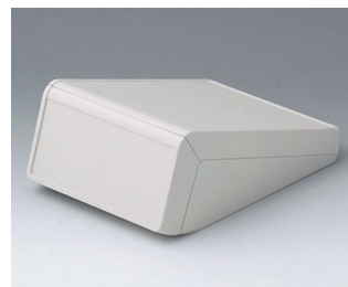
B4056127 UNITEC M, 1.4/0.6 ABS (UL 94 HB) off-white RAL 9002 148x210x80mm IP 40