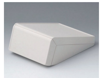
B4056137 UNITEC M, 0.6/1.4 ABS (UL 94 HB) off-white RAL 9002 148x210x80mm IP 40