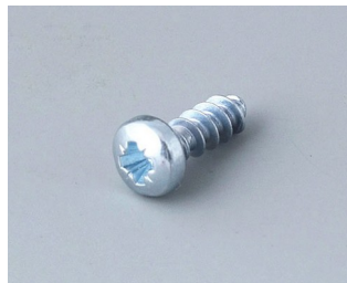
A0308031 Self-tapping screws 3 x 8 mm (PZ1)