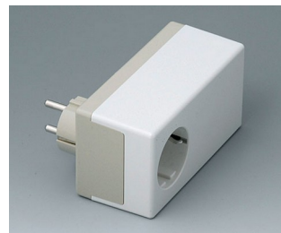
A9022465 PLUG CASE D, Vers. II PC+ABS (UL 94 V-0) pebble grey RAL 7032 120x65x55mm