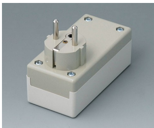
A9011665 PLUG CASE F / D, Vers. I PC+ABS (UL 94 V-0) off-white RAL 9002 100x50x40mm