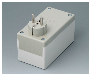
A9021665 PLUG CASE F / D, Vers. I PC+ABS (UL 94 V-0) pebble grey RAL 7032 120x65x65mm