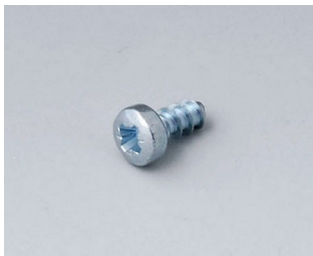
A0306031 Self-tapping screws 3 x 6 mm (PZ1)