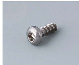
A0308132 Self-tapping screw 3 x 8 mm (T10) Stainless steel

Subject to technical modification without notice. © by OKW Gehäusesysteme, Buchen/Germany.