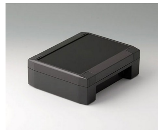
C8014181 SOLID-BOX 145 PC+ABS (UL 94 V-0) anthracite grey RAL 7016 180x145x60mm IP 66, IP 67, IK 08