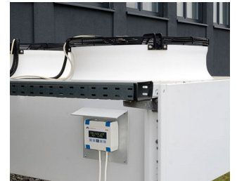
Heating/air conditioning/ventilation control