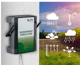
Weather station in agriculture