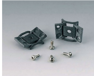
C8100360 Internal hinge set