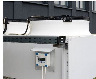
Heating/air conditioning/ventilation control