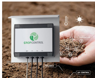
Smart Farming - system for long-term measurements