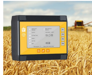
Data recording for harvesters