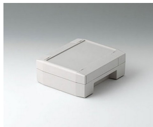
C8011132 SOLID-BOX 115 PC+ABS (UL 94 V-0) light grey RAL 7035 135x115x50mm IP 66, IP 67, IK 08