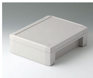
C8017222 SOLID-BOX 175 PC+ABS (UL 94 V-0) light grey RAL 7035 225x175x70mm IP 66, IP 67, IK 08