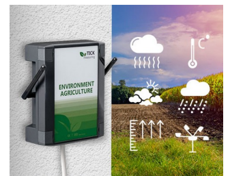
Weather station in agriculture