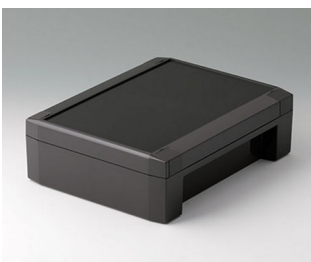
C8017221 SOLID-BOX 175 PC+ABS (UL 94 V-0) anthracite grey RAL 7016 225x175x70mm IP 66, IP 67, IK 08