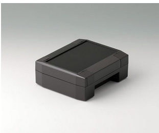
C8011131 SOLID-BOX 115 PC+ABS (UL 94 V-0) anthracite grey RAL 7016 135x115x50mm IP 66, IP 67, IK 08