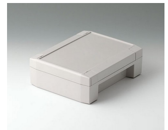
C8014182 SOLID-BOX 145 PC+ABS (UL 94 V-0) light grey RAL 7035 180x145x60mm IP 66, IP 67, IK 08