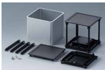
Easy assembly of components through the 3-part enclosure design.

but was also to be anodised, since, for aesthetic reasons, about one third of it was to remain visible under the edge of the plastic. Another point in the performance specifications was the option of installing displays, operating elements and interfaces. It was to be made possible for these parts to be installed on the profile as well as in the top part. Another requirement was that cables for charging devices or interfaces should be able to be routed out of the enclosure without the aluminium having to be processed. In addition, operation should optionally be possible with or without batteries, whether standard or rechargeable batteries, using the same bottom part. The units were also to be distributed with only