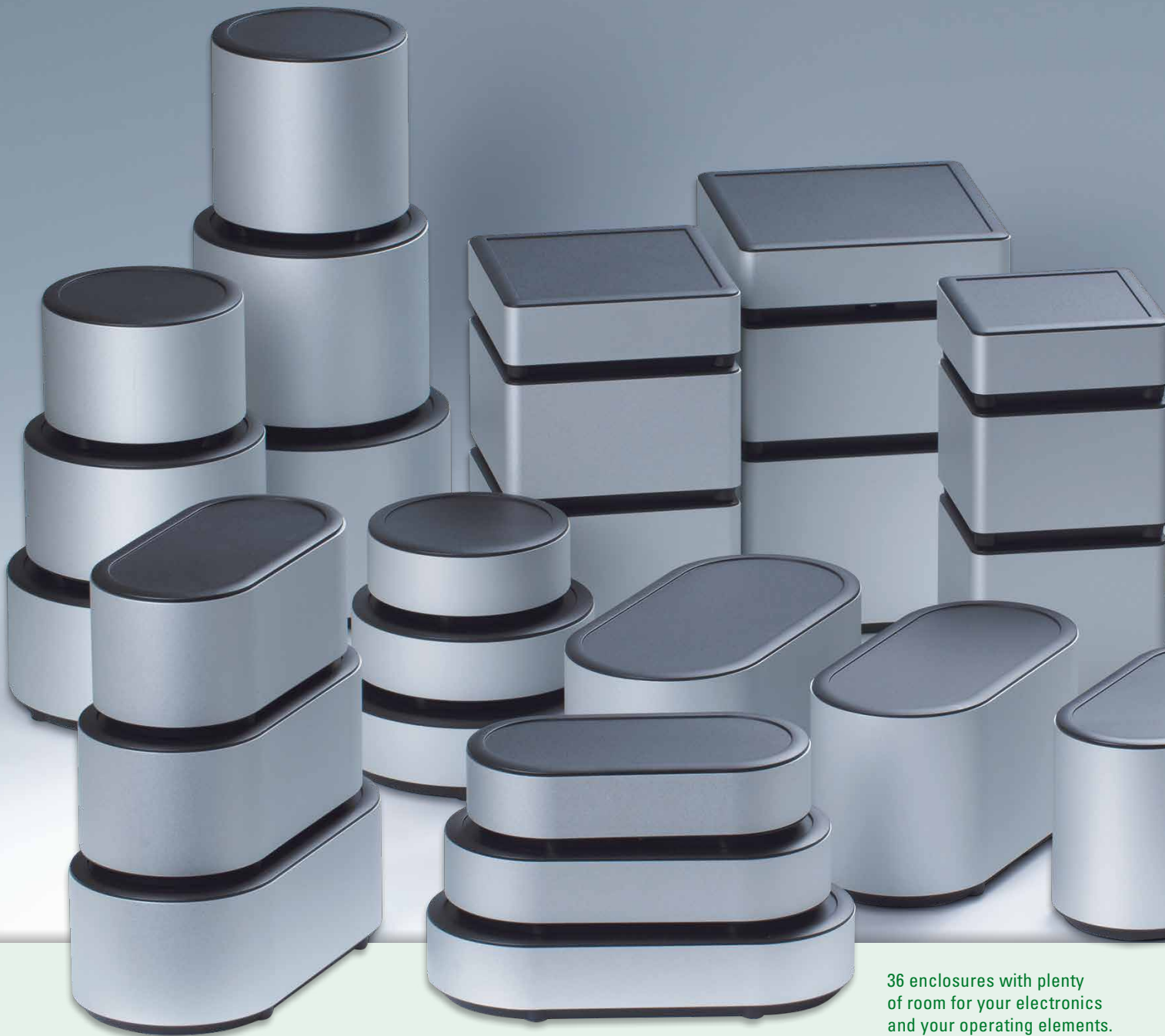
36 enclosures with plenty of room for your electronics and your operating elements.