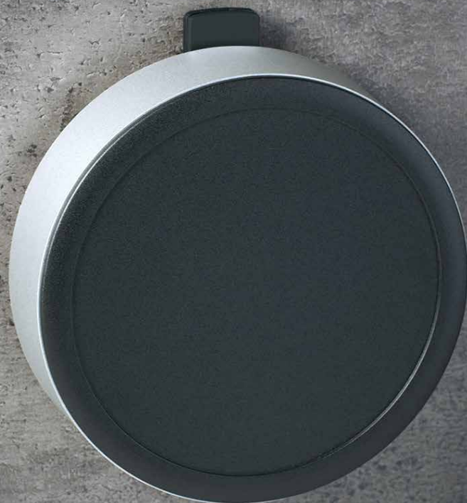
Optional wall mounting with only one screw or covered using internal keyholes (mechanical processing).

but was also to be anodised, since, for aesthetic reasons, about one third of it was to remain visible under the edge of the plastic. Another point in the performance specifications was the option of installing displays, operating elements and interfaces. It was to be made possible for these parts to be installed on the profile as well as in the top part. Another requirement was that cables for charging devices or interfaces should be able to be routed out of the enclosure without the aluminium having to be processed. In addition, operation should optionally be possible with or without batteries, whether standard or rechargeable batteries, using the same bottom part. The units were also to be distributed with only